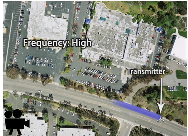
Click image to play video.